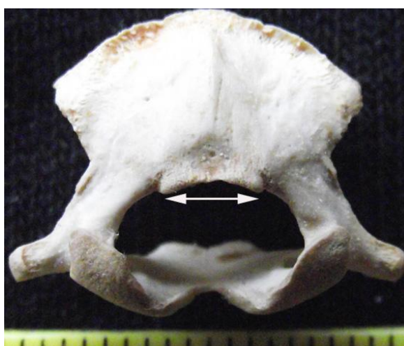
Fig. 2. Deposition of calcium salts in the foramen magnum