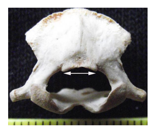
Fig. 1. Swelling of the frontal bone with thinning of adjacent areas: A - low degree, B - high degree

Fig. 2. Deposition of calcium salts in the foramen magnum